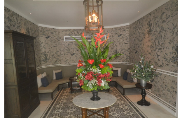
The impressive villa from the era of King Rama V (1868 – 1910) was renovated within the brief time of only four months and became a splendid location including a remarkable wine cellar.